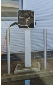
Example of full length